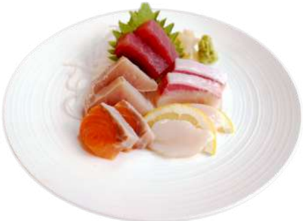
SASHIMI FIVE 2pcs each of tuna, salmon, yellowtail, amberjack