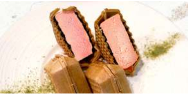
strawberry wafer ice cream sandwich