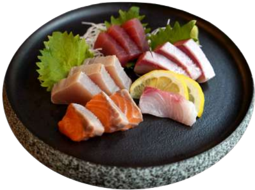
SASHIMI PLATTER 13 pieces, add uni+$10