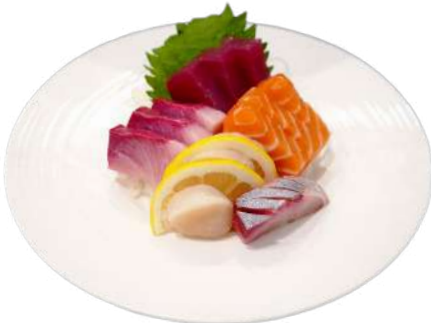
CHIRASHI DON 13pcs of sashimi, rice with toppings, add uni+$10