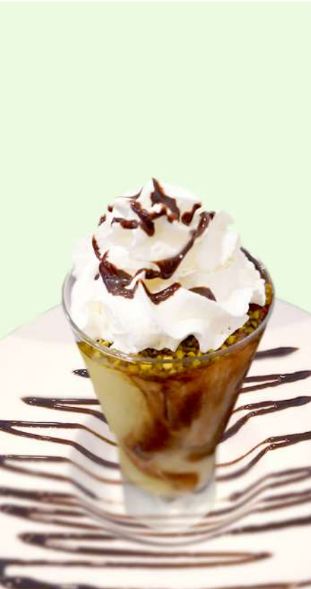
custard gelato swirled with chocolate and pistachio