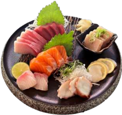
SASHIMI DELUXE 23 pieces, add uni+$10