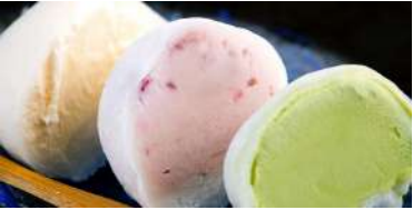
1 pc each of green tea, vanilla, strawberry