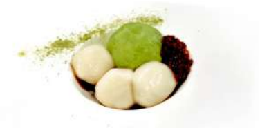
red bean, green tea ice cream, mochi