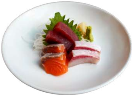
SASHIMI THREE 2pcs each of tuna, salmon, yellowtail