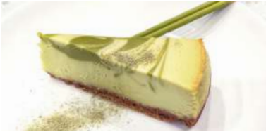
green tea, pocky