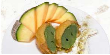
deep fried, green tea